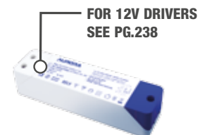
FOR 12V DRIVERS SEE PG.238